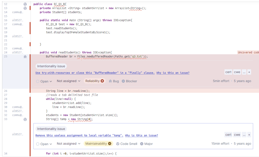
Fig. 3. SonarQube Analysis Example